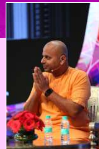
Motivational Speaker Shri. Gaur Gopal Das