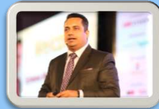
Motivational Speaker Dr. Vivek Bindra