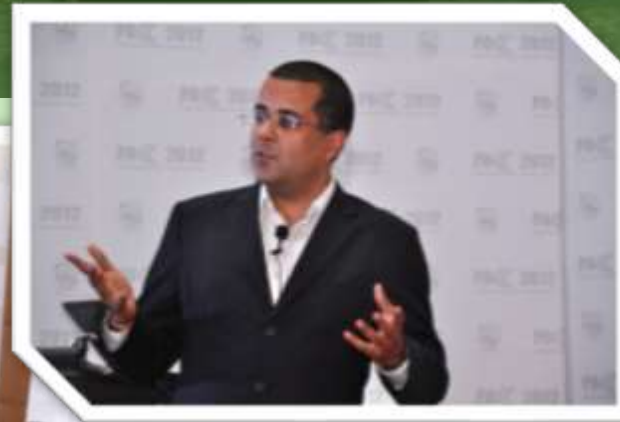
Motivational Speaker Mr. Chetan Bhagat