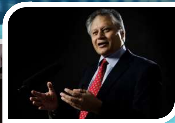
Motivational Speaker Mr. Shiv Khera